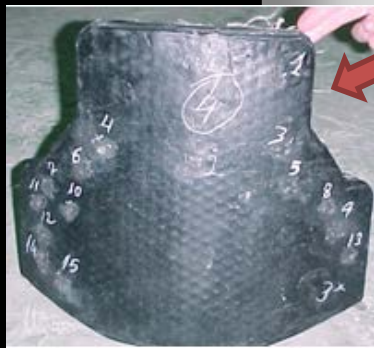
Personal body armor used in a fire fight. Soldier sustained only small bruises on his chest. Notice the multi-hit capability.