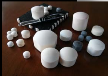
Ballistically Flexible Threat Solution Material